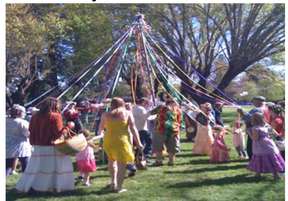
Dancing round the Maypole a few years ago.

The Farmers Market is back at Bud Snyder Park (across from City Hall) for the late Spring and Summer – rain or shine (and often breezy).